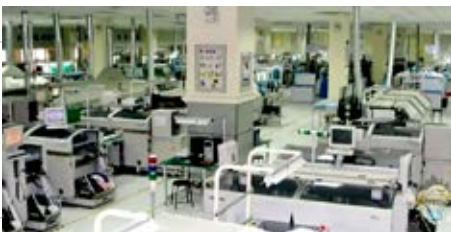
Assembly line facility, APsystems, Jiaxing China

APsystems uses an asset light business model which allows it to leverage experienced, quality contract manufacturers without taking on burdening assets and overheads. Our manufacturing processes have been certified by international standards bureaus, assuring product quality. All products are backed by industry-leading warranties, including extended warranties available to match the design life of the products.