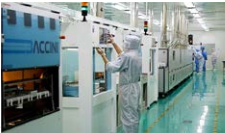
Production & test chamber facility APsystems, Jiaxing China

APsystems uses Kanban, 5S, Six Sigma principles and JIT inventory management, as well as ISO 9001 certified processes.